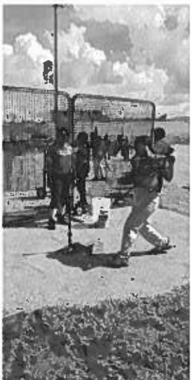
The 2025 Summer PONY Youth Softball Skills and Games Academy completes its 3rd summer softball academy.