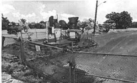
The gated entrance to Liguan Recreation Area #3 Park, located across the street from the Liguan Elementary School in Dededo, is found chained and padlocked closed on June 29, 2026.

He pointed to the success of GFA in running the National Training Facility in Harmon, which serves thousands of participants annually and hosts youth leagues, school competitions, recreational programs, women's football initiatives, coach education courses, referee development and community outreach activities.