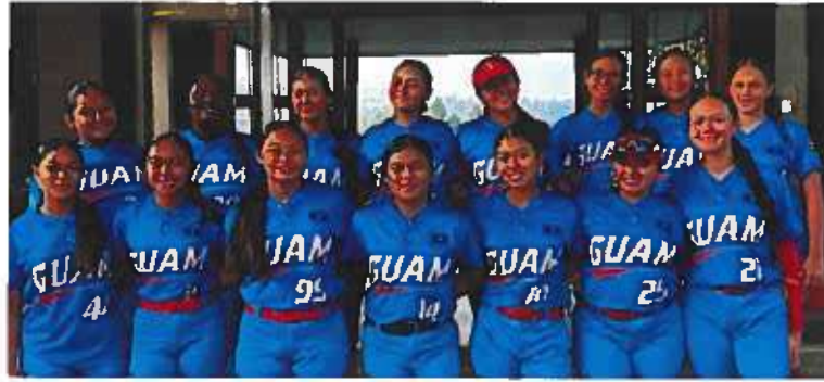
Team Guam at the 2026 Little League Asia Pacific Senior Softball Tournament in Indonesia. GUAM SPORTS NETWORK

in pool play and then doubled up on Indonesia in the semis 14-7.