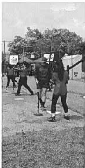
The 2025 Summer PONY Youth Softball Skills and Games Academy completes its 3rd summer softball academy.