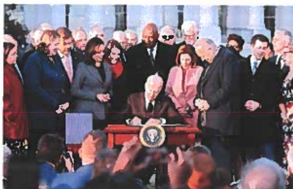
'GETTING THINGS DONE': President Joe Biden signs the Infrastructure Investment and Jobs Act, on the South Lawn of the White House in Washington, D.C., on Monday.

Biden, whose job approval ratings have dropped because of his handling of the economy and other issues, heard supportive chants of "Joe, Joe,