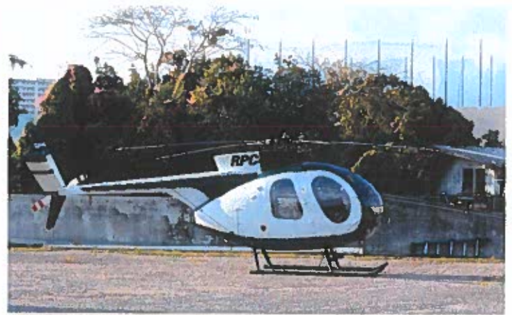
HANSEN: A helicopter is parked at a Hansen Helicopters facility in Upper Tumon in January 2017.

A Hansen aircraft crashed on Sept. 2, 2015, killing pilot Rafael Antonio Cruz Santos. Hansen later gave FAA logbook entries that falsely indicated