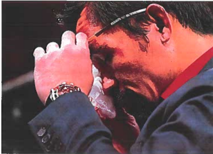
Manny Pacquiao, of the Philippines, wipes his eye at a news conference after his loss to Yordenis Ugás, of Cuba, in a welterweight championship boxing match in Las Vegas Aug. 21.

The eight-division world champion still acknowledged the larger fact that was obvious even to most of his devoted fans around the world: He deserved his loss to Ugás, a talented opponent who probably wouldn't have been much trouble for prime Pacman.