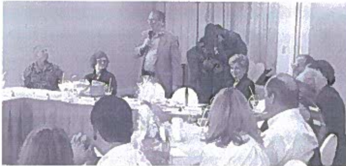
DELEGATION: Rep. Bob Goodlatte, R-VA, chairman of the House Judiciary committee, speaks during the congressional delegation's briefing with Del. Madeleine Bordallo and military leaders yesterday at the Hilton Guam Resort & Spa.