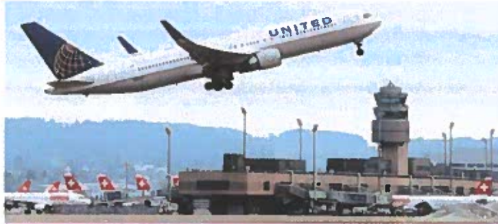
SEVERING TIES: A United Airlines plane takes off from Zurich airport on Jan. 9, 2018. The airline announced it was no longer offering National Rifle Association members discounted rates.

The issue of gun control, and the NRA's role in opposing it, became the focus of renewed national debate after a former student killed 17 people on