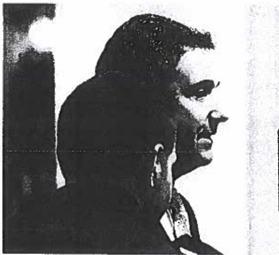
COHEN: Former Trump personal attorney Michael Cohen arrives to testify behind closed doors before the Senate Intelligence Committee inside the Senate Hart Office Building on Capitol Hill in Washington, D.C., on Feb. 26.

that he was not engaging in witness intimidation.