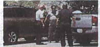
BAG: This screenshot was taken from a video that shows police officers who responded to a call that a man with a rifle bag had walked into the Pentagon Federal Credit Union branch in Hagåtña on Thursday.