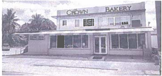
SCENE: The parking lot of the Crown Bakery along Route 10 Barrigada was the scene of a reported robbery on Monday morning.

When she asked the co-worker who did it, he said, "two guys ... they took the bag."