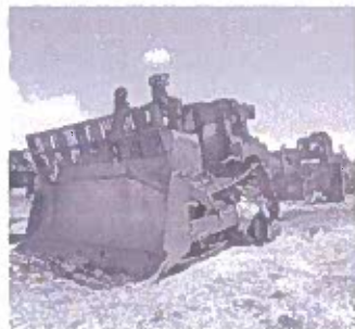
LANDFILL: A bulldozer and a compactor are serviced at the Layon landfill in May 2017. Guam Resource Recovery Partners, the Guam Economic Development Authority and the governor's office have agreed to a second round of mediation in GRRP's bid to build a waste-to-energy plant.