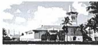
MAR-A-LAGO: The Mar-a-Lago club in Palm Beach, Fla., April 21.

After she appeared confused about the trial in Fort Lauderdale, Florida,