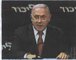
NETANYAHU: Israeli Prime Minister Benjamin Netanyahu delivers a statement during a news conference in Jerusalem on Sept. 18.

The campaigns run by Netanyahu and Gantz pointed to only narrow differences on many important issues, and an end to the Netanyahu