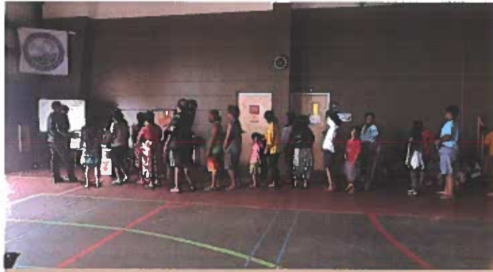
FOOD ASSISTANCE: People line up for food supplied by Guam Homeland Security on Sunday at the Astumbo gym in Dededo. On Sunday, there were 171 people who remained at the gym.

"Families that have the ability to pay rent may be placed in the Guam Housing