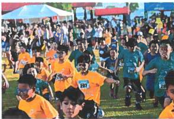
The 14th Guam Ko'ko' Kids Fun Run kicked off Ko'ko' Weekend with 483 runners under the age of 12 on April 15, 2023.