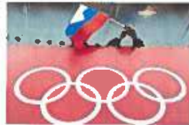
A Russian flag is held above the Olympic Rings at Adler Arena Skating Center during the Winter Olympics in Sochi, Russia, Feb. 18, 2014. One year after the invasion of Ukraine began, Russia's reintegration into the world of sports threatens to create the biggest rift in the Olympic movement since the Cold War.

The IOC now says it will not support the return of