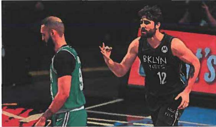
Nets forward Joe Harris, right, reacts after a 3-point shot against Celtics guard Evan Fournier during the first quarter of Game 2 of the first round of the NBA Playoffs Tuesday at Barclays Center in Brooklyn.