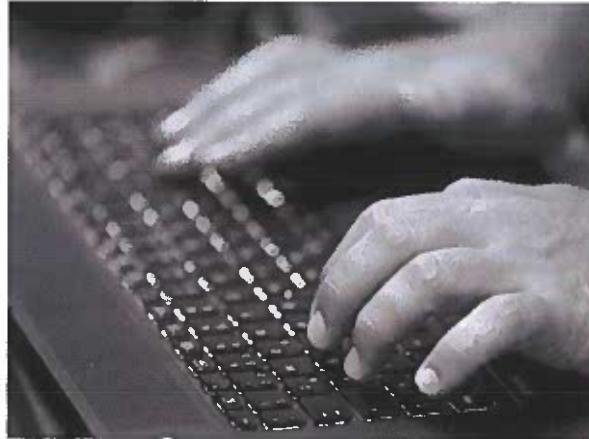
SECURITY PROBLEMS: A man types into a keyboard during the Def Con hacker convention in Las Vegas, Nevada, July 29, 2017. Reuters

Democratic National Committee officials told Reuters they have completely rebuilt the party's computer network, including email systems and databases, to avert a repeat of 2016, when Russian intelligence