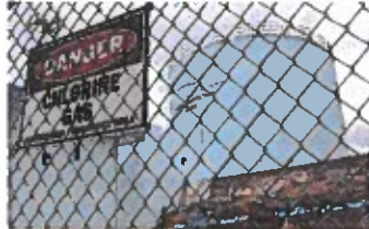
TANK: A water well located across from the Government House in Agana Heights is shown on April 10.

The Guam Waterworks Authority is in the process of buying filtration systems for two water wells contaminated with higher-than-advisable levels of perfluorooctane sulfonate, or PFOS.