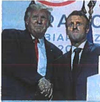
TECH TAX: French President Emmanuel Macron right, and President Donald Trump shake hands during a joint-press conference in Biarritz, southwest France on Aug. 26, on the third day of the annual G7 Summit. The U.S. has proposed tariffs on roughly $2.4 billion in French products in response to a tax on digital revenues that hits large American tech companies.

The tariffs would be imposed after a public comment period concludes