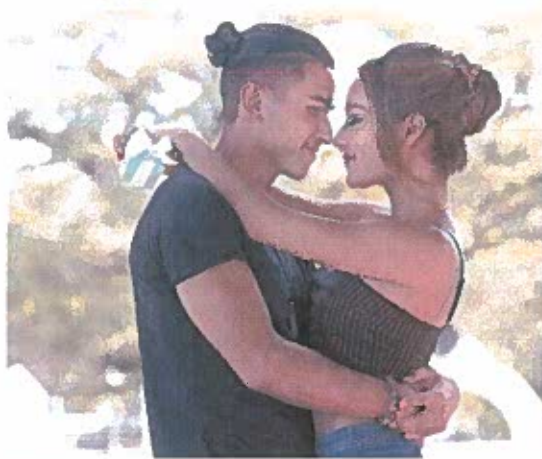
'LIFETIME MEMORIES': The blue box that accompanies a Tiffany & Co. purchase often has been imitated, but impossible to duplicate.