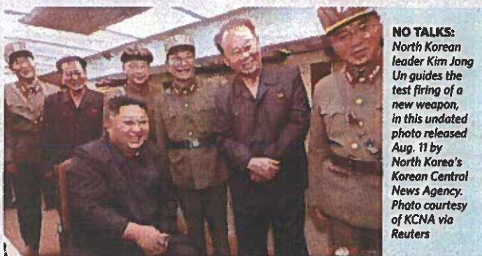
NO TALKS: North Korean leader Kim Jong Un guides the test firing of a new weapon, in this undated photo released Aug. 11 by North Korea's Korean Central News Agency.

In a separate statement carried by KCNA, a senior North Korean diplo-