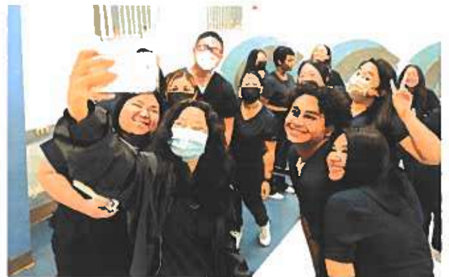
▲ WE DID IT: Students who have completed the Guam Community College Certified Nursing Assistant Boot Camp II take a selfie at a recognition ceremony at the GCC campus yesterday in Mangilao.

Nearly all of the 19 qualified have recently turned in their applications to test for CNA licensure through the Guam Board of Nurse Examiners.