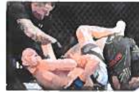
Nate Diaz, left, reacts after defeating Tony Ferguson in a welterweight bout during the UFC 279 mixed martial arts event Sept. 10, 2022, in Las Vegas.

Diaz's desire to fight the vaunted Chimaev seemed foolhardy in a distinctly Diaz way, but the late matchup with Ferguson was much more competitive than the original booking likely would have been.