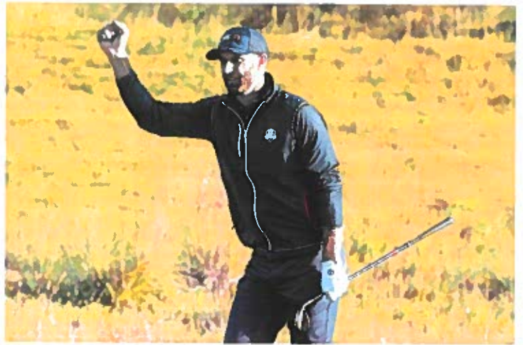
Team USA's Dustin Johnson reacts on the third hole during a Ryder Cup foursomes match at the Whistling Straits Golf Course in Sheboygan, Wis. Sept. 25.

Johnson also joined forces with Xander Schauffele to win a Friday afternoon best-ball competition 2 and 1 over Bernd Wiesberger and Paul Casey.