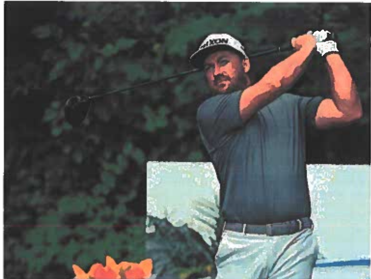
Graeme McDowell, seen during the 2020 Wyndham Championship, thinks the PGA should add a 72-hole, alternate-shot foursomes tournament.