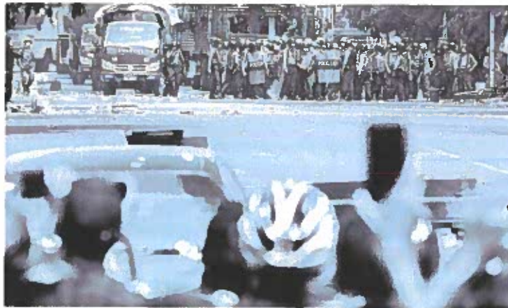
UNREST: Police stand on a road during an anti-coup protest in Mandalay, Myanmar, on March 3.

because "we are particularly concerned about the buildup of military action in the northwest of the country, and we are concerned that this rather mirrors the activity we saw four years ago ahead of the atrocities that were committed in