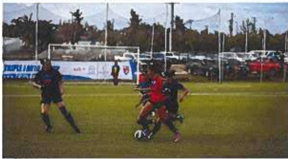
Athletes in action during a game for the 2025-2026 Bud Light Women's G-League regular season.