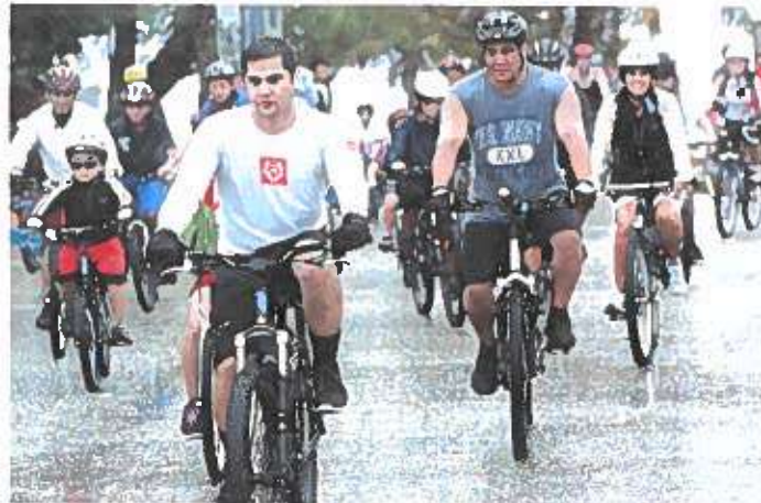
In this file photo, cyclists begin their journey at Ypao Beach during the Guam Cycling Federation's 1 Bike Village ride in Tumon. Triple J Ford is setting up for its Built Tough Monsoon MTB Race Sept. 17, 2022, at the Guam International Raceway Park in Yigo.

Show time for participants is 6 a.m. with the competition starting at 7 a.m.